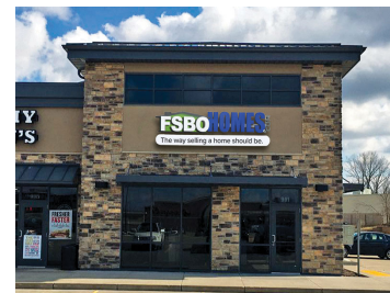
FSBOHOMES Quad Cities