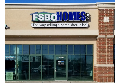
FSBOHOMES Sioux Falls 2101 W 41st St, STE 29A Sioux Falls, SD