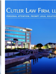
Cutler Law Firm, LLP Real Estate Attorney