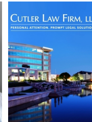
Cutler Law Firm, LLP Real Estate Attorney