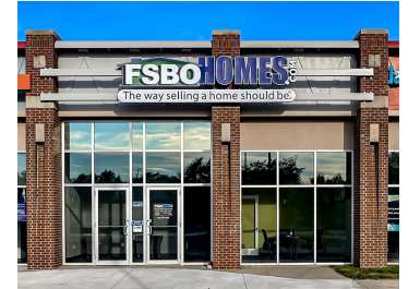
FSBOHOMES Ankeny 110 N Ankeny Blvd, STE 600 Ankeny, IA