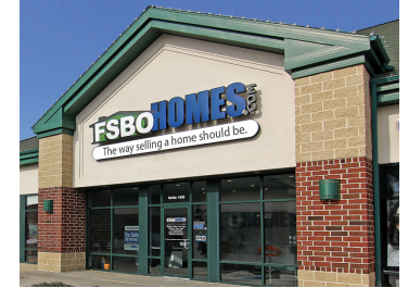
FSBOHOMES Cedar Rapids 576 Boyson Rd NE, Ste 102 Cedar Rapids, IA