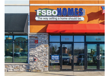
FSBOHOMES Iowa City 931 25th Ave Coralville, IA

with questions about the home buying process