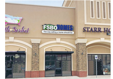
FSBOHOMES Oklahoma City 15124 Lleytons Ct, Ste 113 Edmond, OK