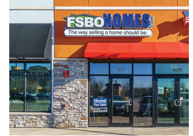
FSBOHOMES Iowa City 931 25th Ave Coralville, IA