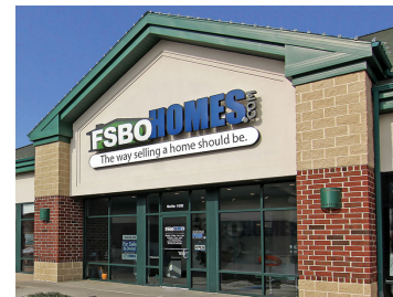
FSBOHOMES Cedar Rapids