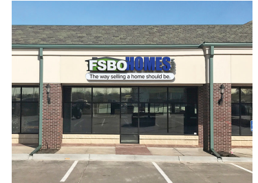
FSBOHOMES Omaha 17725 Welch Plaza, Suite D Omaha, NE