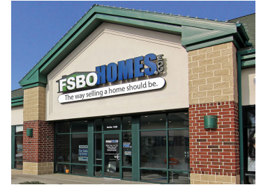
FSBOHOMES Cedar Rapids 576 Boyson Rd NE, Ste 102 Cedar Rapids, IA