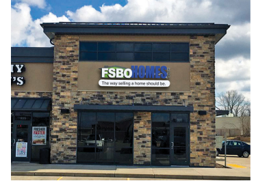
FSBOHOMES Quad Cities 901 Middle Road Bettendorf, IA