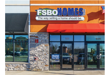
FSBOHOMES Iowa City 931 25th Ave Coralville, IA