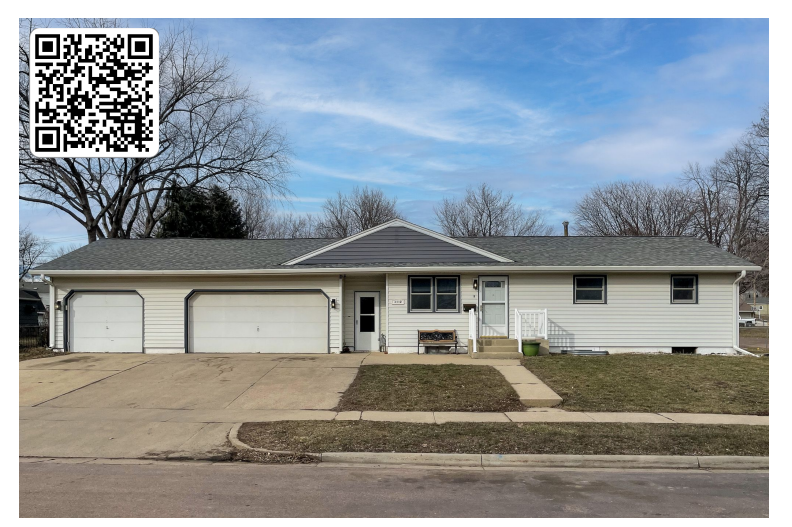
3112 E 21st St, Sioux Falls $279,900 | 5 bds | 1 ba | 1,932 sqft

Call (605) 728-2426 to inquire about this home.