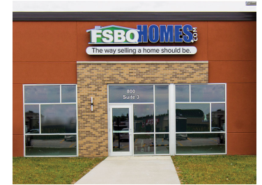
FSBOHOMES Dubuque 800 Wacker Dr, STE 102 Dubuque, IA