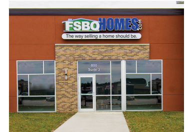
FSBOHOMES Dubuque 800 Wacker Dr, STE 102 Dubuque, IA