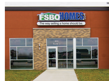
FSBOHOMES Dubuque 800 Wacker Dr, STE 102 Dubuque, IA