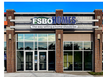
FSBOHOMES Ankeny 110 N Ankeny Blvd, STE 600 Ankeny, IA