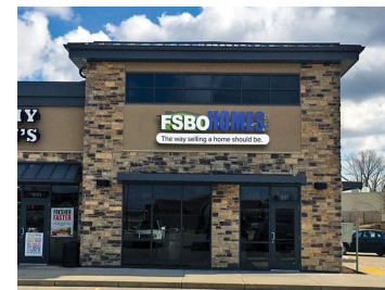
FSBOHOMES Quad Cities